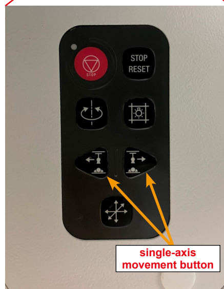
Fig.5 Rear switch (top) and single-axis movement button (bottom)

Traditionally, RADspeed Pro has rear switches on the back of the X-ray tube support, enabling operations like vertical rotation, all-free, collimator lighting, and emergency stop. A new single-axis movement button has been added to the X-ray tube support equipped with POWER GLIDE. This function allows for automatic movement when pressed and is usable for transferring the X-ray tube between staff and for aligning the tube from the back (Fig.5). In the radiography room, there are often situations where it's not possible to operate the X-ray tube from the front, especially in emergency imaging scenarios requiring rapid and safe responses, often involving multiple technologists. This button allows smooth transfer of the X-ray tube to staff positioned on the opposite side of the table and facilitates equipment movement to the next position. In equipment without rear switches, transferring the X-ray tube was done using vertical axis rotation, but this equipment allows linear transfers, reducing the risk of contact with drip stands or other staff.