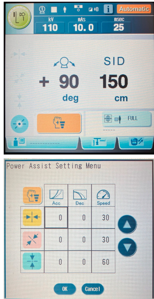
Fig.3 POWER GLIDE assist level adjustment screen (top) and customization screen (bottom)

features for acceleration, deceleration, and maximum speed for each movement axis, allowing users to adjust the feel of use according to each facility's examination types and room sizes (Fig.3).