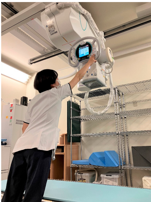
Fig.4 Operation at the retracted position

pull down the tube from its retracted position with minimal effort (Fig.4). Their feedback confirms significant reduction in physical strain, indicating the high assistive performance of POWER GLIDE.