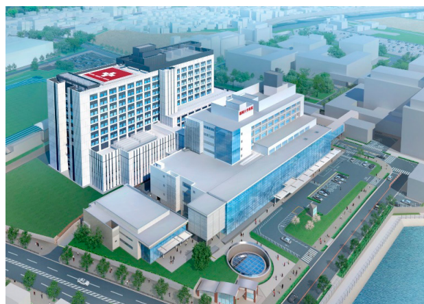
Fig.1 Anticipated completion of the new wing (top) and new main building (provisional name) of Fukuoka University Hospital

December 2023, a new main building is expected to be completed, enhancing the medical services we offer.