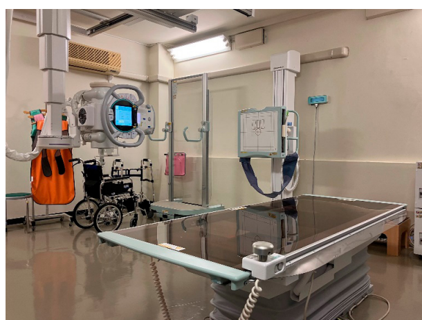
Fig.2 System appearance

The updated radiography room, one of four in the main building primarily used for chest and abdominal imaging, previously had separate X-ray tubes for standing and supine positions. In selecting equipment, emphasis was placed on throughput and operability for chest and abdominal imaging. The newly introduced RADspeed Pro with POWER GLIDE ( Fig.2 ) has a single X-ray tube, but the